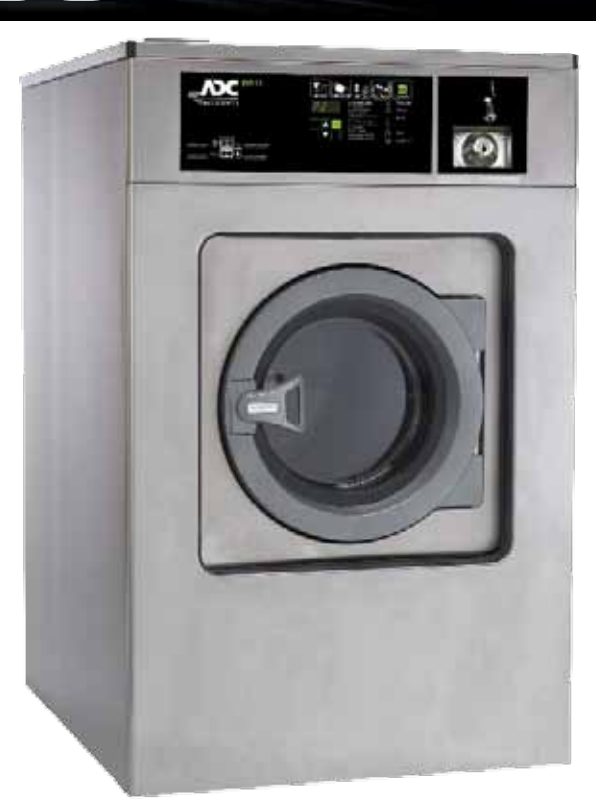
EWH-60 Coin Washer/Extractor